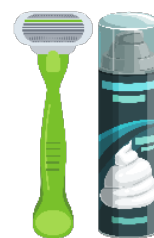
Nonelectric Razors + Shaving Cream

The drop-off boxes are across from the church office. Your help makes a difference! Thanks.