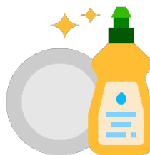
Liquid Dish Soap